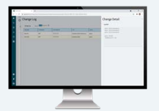
Risk Management—Automatically track changes with risk mitigation tools—such as table and field level audit capabilities

Enterprise Resource Planning (ERP) systems control the majority of corporate information that could potentially be at risk from piracy, fraud, and sabotage concerns. The only way to truly manage and mitigate risk across the organization is to have a fully integrated, end-to-end solution providing a single, verifiable set of financial and operational metrics. Epicor GRC provides an integrated enterprise solution with built-in, application level risk mitigation tools and Business Process Management (BPM) to audit trails and secure workflow automationkey elements of data integrity and security. It also incorporates the ability to infuse business insight through Epicor Business Intelligence and Analytics, as well as allows organizations to embrace data governance and data protection strategies, help control risk, and handle regulatory compliance.